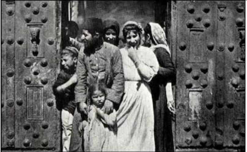
The Ottomans worked to repress the Yishuv and initiated mass expulsions of Jews from Palestine during World War I.

Accordingly, Talaat's declaration was politically relevant rather than purely hypothetical. Apart from ensuring the safety of Jewish communities in those parts of the empire still in Ottoman hands, it provided Istanbul with a potentially valuable card for the postwar peace talks.