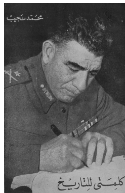
1975 Cover of Najib's Memoirs