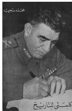
1975 Cover of Najib's Memoirs