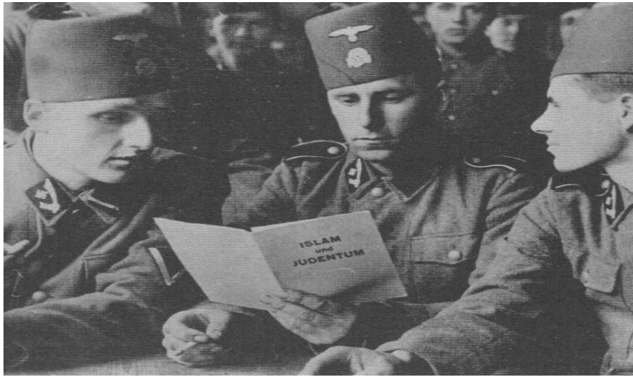
For Muslim soldiers only: Nazi booklet Islam and Jewry containing the Grand Mufti's 1937 appeal to all Muslims to cleanse their lands of Jews

Information for the Middle East, which is not a main topic of this book, is hard to find. We know of three dozen cases of Nazi immigrants – in North Africa including Algeria and Tunisia, in Arab neighbors of Israel, and in Saudi Arabia and Iran. Indications also point to Afghanistan and Pakistan.