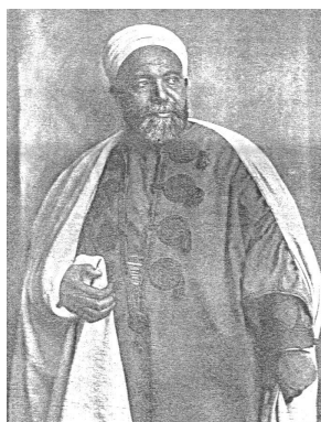
خادم العلم والنسانية صالح الشريف التونسي

The Ottoman Sultan-Caliph called for jihad in World War I . According to a fatwa, he, being the sovereign of all Muslims, wanted them now to fight with infidels against infidels and their Muslims. The latter had not only no right to fight back, but they had to turn against their foreign overlords. Sheikh Salih al-Sharif al-Tunisi (1869-1920), a Tunisian mufti (picture), confidant of the Ottoman war minister Enver Pasha and activist in Max von Oppenheim's News Department, confirmed in a booklet the new jihad doctrine on the side of the Austro-German central powers.